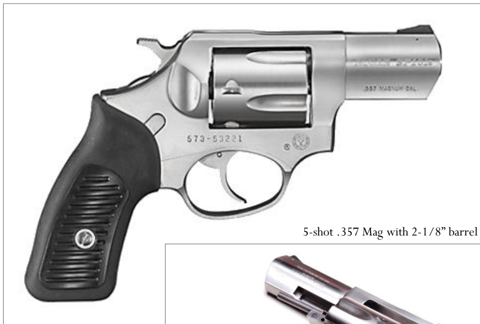
5-shot .357 Mag with 2-1/8" barrel