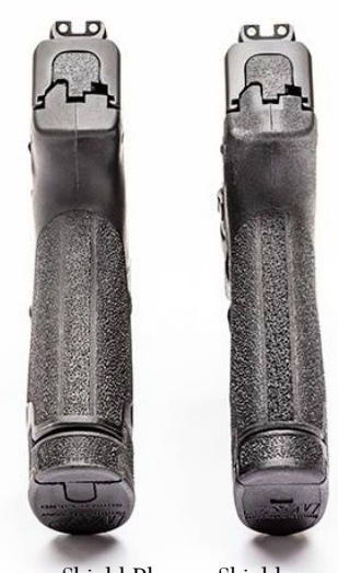
Shield Plus vs. Shield

If it is not carried in a holster it is best to leave the chamber unloaded if not fitted with a heavier 10 pound trigger if you have the version without a safety catch (too small for easy activation and not ambidextrous), while users need to ensure their finger is outside the trigger