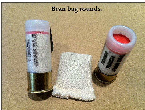
Bean bag rounds.

It is best fitted with a light for use in low light situations (always identify targets).