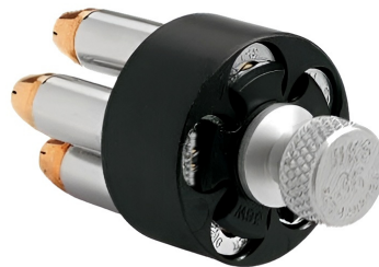
HKS Speedloader Model 36-A

The S&W Model 36 "Chief's Special" (c. 1950) is a small J-frame revolver which uses a steel frame. The latest variant, the Model 36 Classic (c. 2025), does not have an Internal Lock frame that previous variants had from 1996 until the Classic was introduced, which is highly desirable as these locks can fail, and when they do they lock the gun up. If you want to lock it when in storage then simply place a padlock through the frame or use a Master Lock Gun Lock.