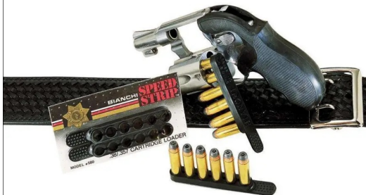
Bianchi Speed Strips

A .38 Special chambered Model 36 Classic with a 1.88" barrel. The external hammer allows the use of a thumb snap that will securely hold the revolver in a holster. It also allows it to be thumb cocked for a lighter trigger pull for more accuracy at longer ranges, and allows users to perform a safe cylinder rotation check after loading it by simply pulling the hammer back slightly to unlock the cylinder.